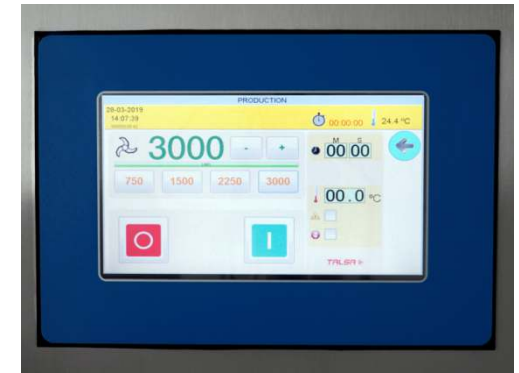
7" digital touch screen.