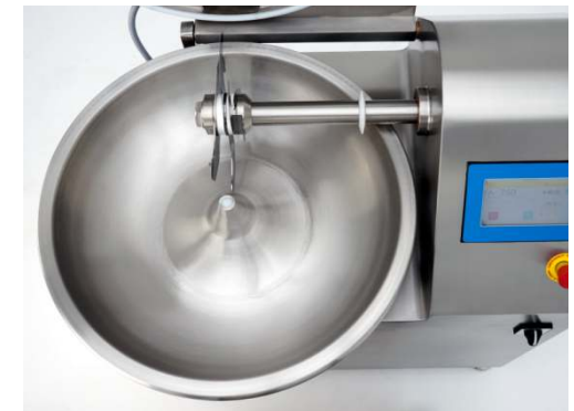
Solid cast stainless steel bowl. CNC precision machining.