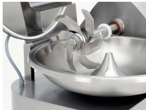
Optional 6-knife head.