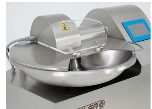
Transparent noise protection cover.